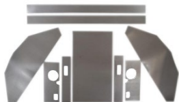
◀ 402605KS Padding Kit