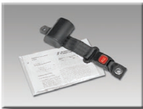
◀ 31579KS Handrail Restraint Retractable - for 51" Platforms